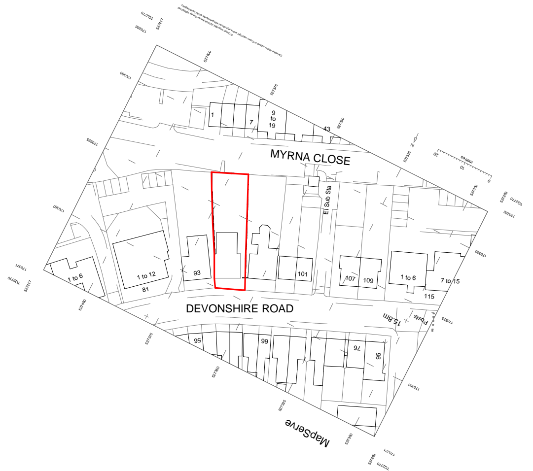
OS MAP 1 : 1250